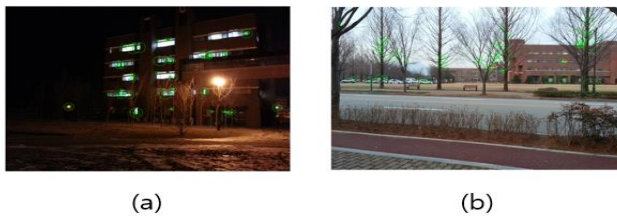
Fig. 2. Feature detection results

We also apply the SIFT feature points detection method to another image set to find out the geometrical relationship among the image pairs.