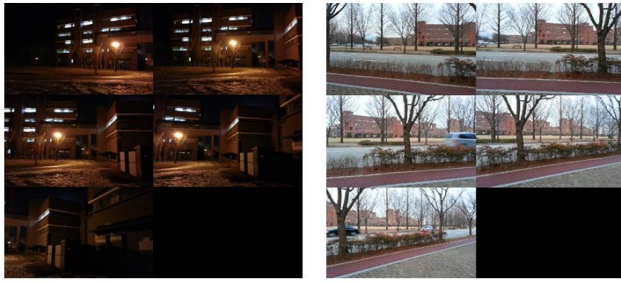
Fig. 1. Input images for feature detection

even that picture captured in lightless circumstance, the feature points are correctly extracted from the images